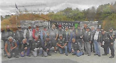
Members of the Vermont CMVA.