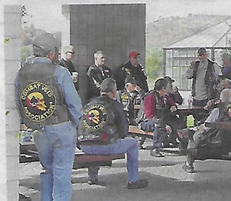
The CVMA sharing coffee at the Vietnam Veterans Memorial in Sharon, Vermont.